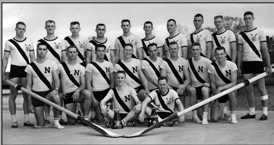
1961 Varsity and JV Eastern Sprints Champions